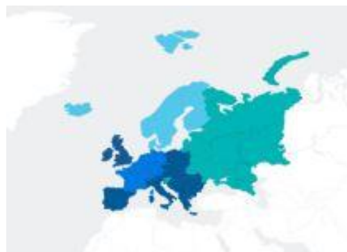
(Too general in nature to depict my ancestry)